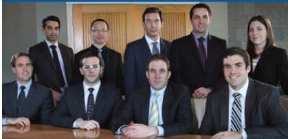
Greystone Managed Investments Greystone Fixed Income Team