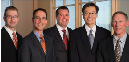
Brandes Investment Partners Brandes Global Large Cap Investment Committee (GLCIC)