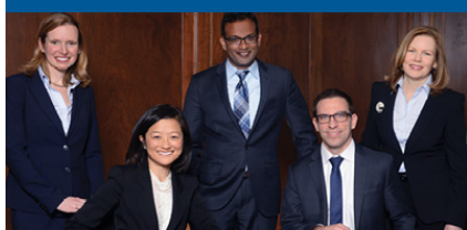
Sionna Investment Managers Sionna Investment Team