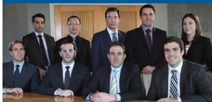
Greystone Managed Investments Greystone Fixed Income Team